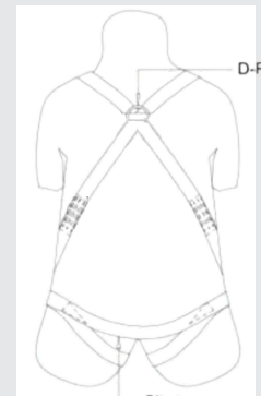
BACK VIEW Stitching design